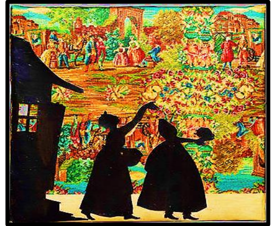
UNTITLED (1994) By Kara Walker