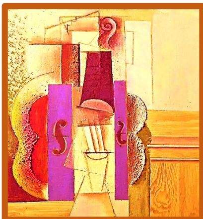
VIOLIN HANGING ON THE WALL (1912) By Pablo Picasso

Jump to the 20 th century and the art period known as ‘Modern Art’ when some artists turned from making realistic art – art that looked like real people and landscapes --- to create wild images that totally came from their imaginations and experimentation.