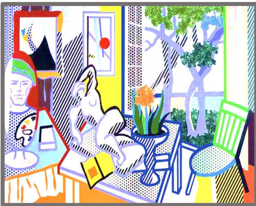
HIS OWN DEVISING (1997) By Roy Lichtenstein