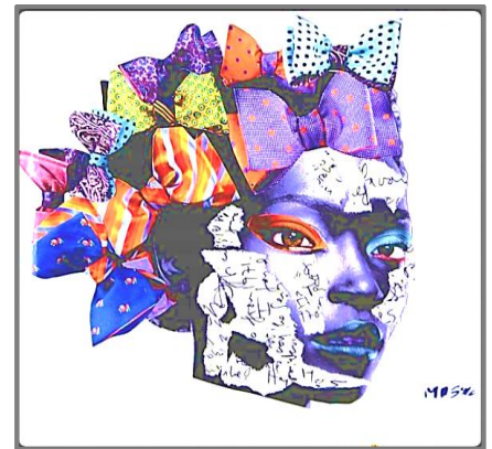
UNTITLED (2014) By Massogona Syla

For Many More Simply Google: 'Collage Examples'