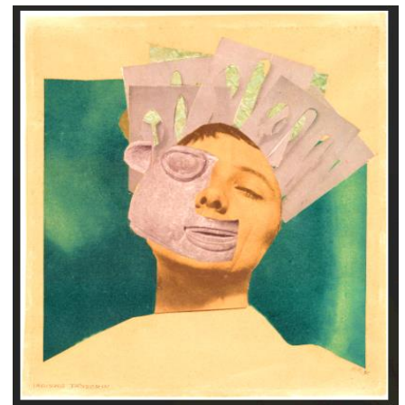
INDIAN DANCER (1930) By Hannah Hoch