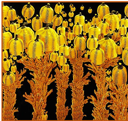
REPETITIVE VISION (1996) By Yayoi Kusama