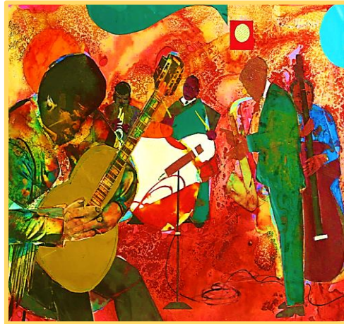
GUITAR MAGIC (1986) By Romane Bearden