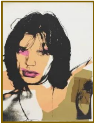
MICK JAGGAR (1975) By Andy Warhol

Some of the Modern Art movements that embraced collage include Cubism , Dadaism , and Surrealism , and in the mid-20 th Century Pop Art . As mass-produced images started to dominate culture and societal goals became a push to homogenize our differences, collage has become an expression of rule breaking and unconventionality, as well as an expression of the fragmentation and complexity of our modern world.